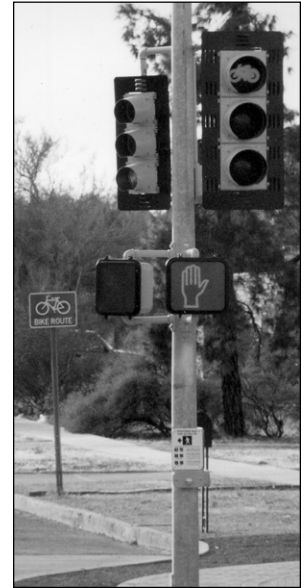
TOCAN Crossings in Tucson: "TwO modes CAN Cross at the same time."

Tucson has also introduced a crossing signal technology that help drivers brake for pedestrians. Coupled with our "Watching Over the Pedestrian Like a Hawk" media campaign, the HAWK (High-intensity Activated CrossWalk) system has generated one of the nation's highest driver yielding rates, increasing compliance from 30 percent, under normal conditions to 93 percent over an eight-month study period. The City of Tucson will receive a national award for pedestrian safety from several governmental and non-governmental agencies for this innovative program.