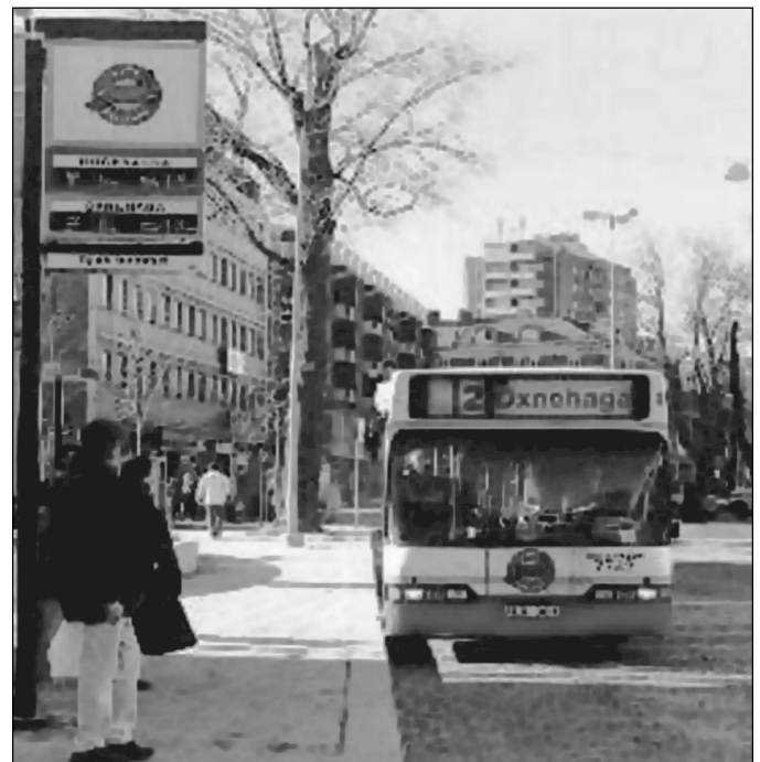
Jönköping's City bus system utilizes ITS to improve transit service and to encourage shopping in the town center. To read the unabridged version of this article visit http://www.jlt.se .

Co-operation has been a key word in the project. Without a positive relationship between the Public Transport Authority and the city the project could not have been implemented. It is also important to have a good relationship with local entrepreneurs and their staff. Thanks to the fact that all the decision-makers had the courage to believe in the project, initial difficulties during the implementation phase were resolved. Moreover, Jönköping got a public