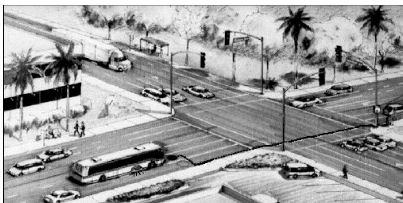
Traffic signal priority systems, like the one depicted above, detect buses and prolong green lights or change red lights to green.

The flexibility offered by smart card systems permits operators to more easily implement fare changes by uploading new fare structures electronically to system payment